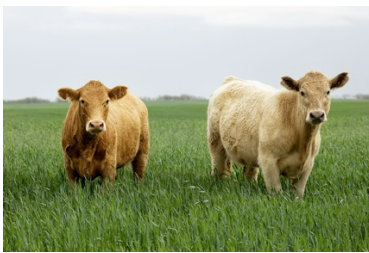
Original File Size: 6.9 MB

Example images from the Landscape.doc test. The only difference I was able to see between these two images was the loss of smoothness in the cloud and skyline - in the reduced file. The 'information' in the image is perfectly clear and hasn't been lost with the reduction in file size.