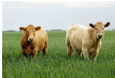
Reduced File Size: 49 KB